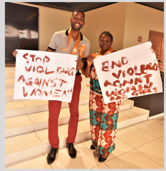
The PIND Team participated in advocacy activities to promote VAWG prevention during the 16 Days of Activism Against Gender-Based Violence campaign in 2017, and on International Women's Day on March 8, 2018.

in adult life, or may be prone to perpetrate violence themselves. In research conducted in 2008 by an international medical journal, it found that children or teens who witnessed domestic violence were more likely to use violence at school or in the community in response to perceived threats, and more likely to commit crimes.<sup>4</sup> The study also found that they are likely to become abusers themselves later in life; perpetuating the cycle of domestic violence across generations. Severe cases of domestic violence which leads to divorce or separation between parents, can have negative psychological implications for children. It also threatens the stability of the family as parents tend to fight for the custody of the children. Young children from broken homes tend to feel insecure and often angry and withdrawn for fear of being abused by school mates and friends who are aware of their situation. This can lead such children growing up to distrust people, going into relationships with an aggressive mode or becoming afraid to go into an intimate relationship. In a desperation to fill the gap of a missing parent figure, these children may be