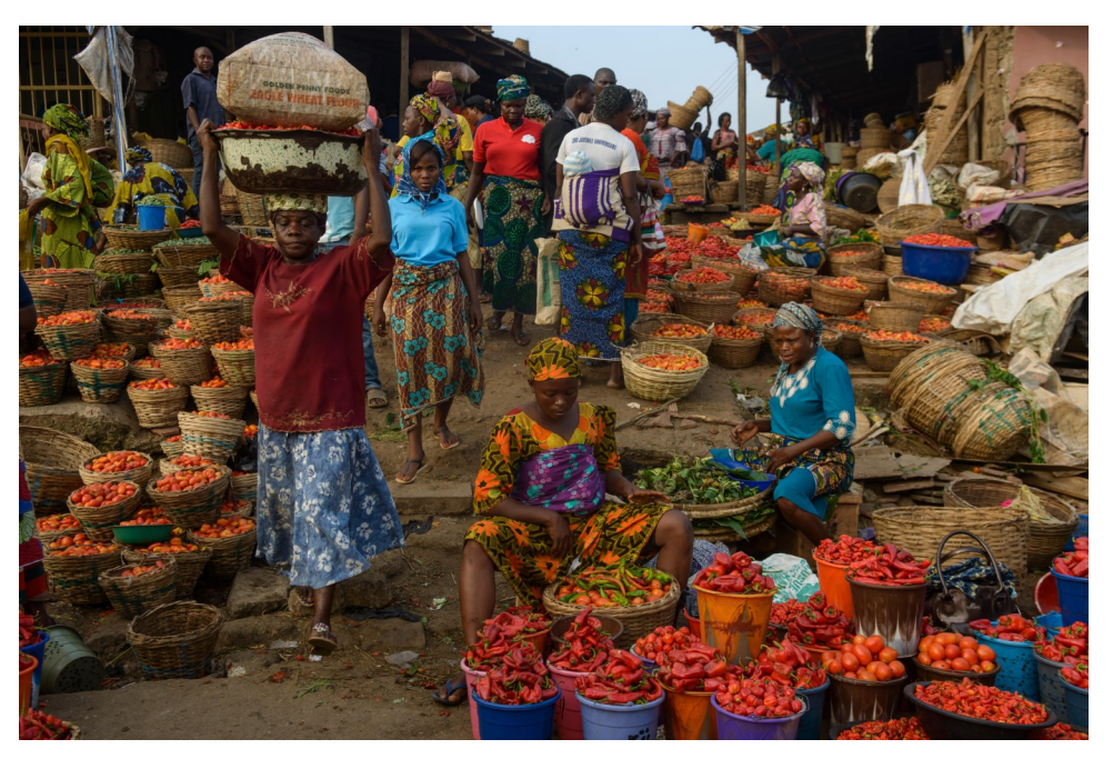
About This Brief: Partnership Initiatives in the Niger Delta (PIND) is committed to breaking the culture of silence around Violence Affecting Women and Girls (VAWG) in Nigeria through data driven approaches. This quarterly brief highlights thematic issues and provides updates on reporting of VAWG incidents in the Niger Delta, to inform prevention efforts by policy makers and practitioners. Data used in this brief is drawn from sources such as Nigeria Watch, ACLED, CIEPD, NSRP formatted on the P4P Peace Map: http://www.tgpcloud.org/p4p/index.php?m=p4p

The impact of Domestic Violence is not limited to the survivors of the abuse alone, it also has negative impacts on family and society at large.